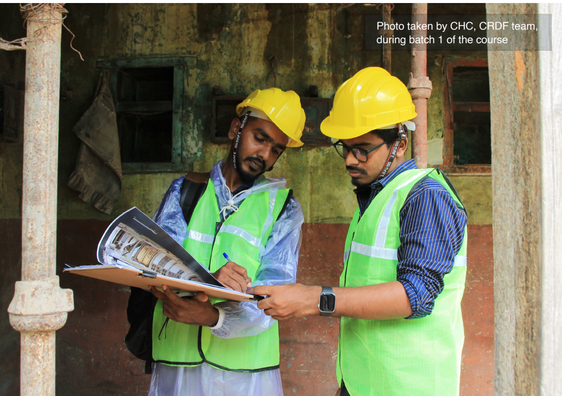
during batch 1 of the course