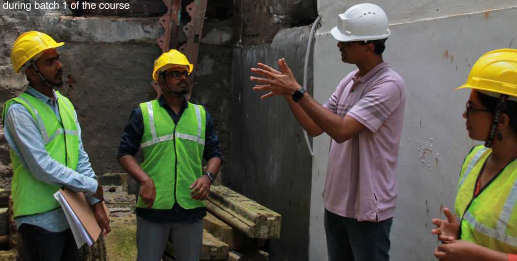
during batch 1 of the course